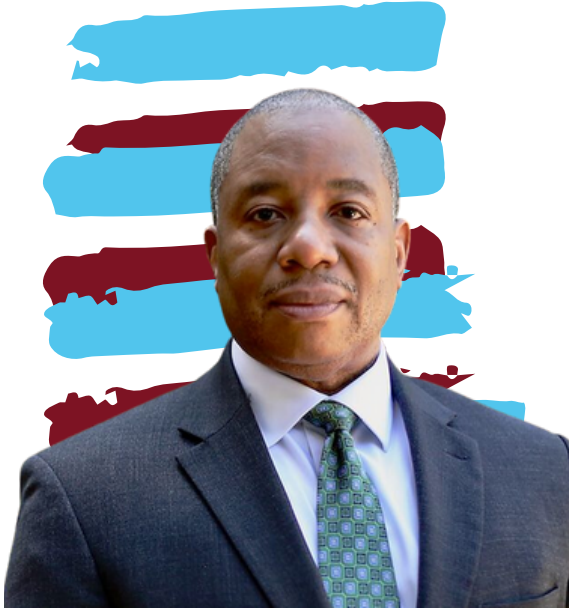
Maurice "Mo" Green

Public Education Impact: The Superintendent of Public Instruction oversees the public school systems, staying informed about the important issues and the needs of public schools in order to provide the governor with recommendations for potential legislation.